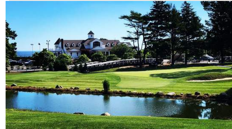
Port Jefferson Country Club

Expansive marina with a dockside restaurant as well as a state of the art spa