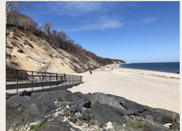
East & West Beach

Offers exhibitions, social functions, farmers markets, and other events