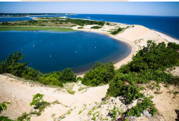
McAllister County Park

Features an 18-hole premier golf course as well as a clubhouse, fitness center, and fine dining!