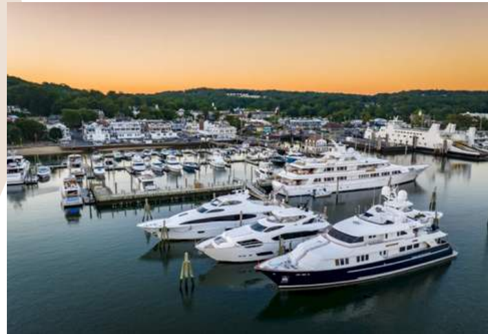
Danfords Hotel & Marina

Port Jefferson is a historic village that offers scenic views, great schools, lots of shopping, tasty restaurants, and so much more!